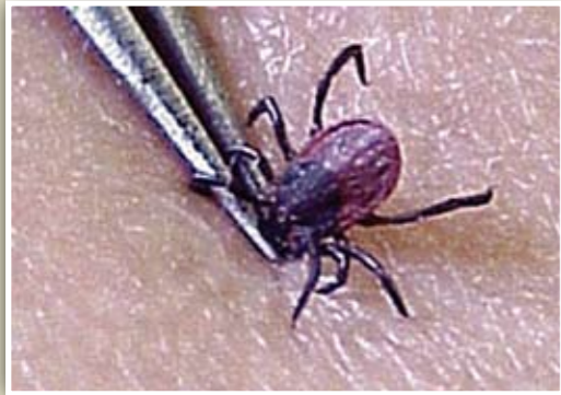
Image used with permission of the California Department of Public Health

Tweezers are used to remove attached ticks. (photo enlarged to show detail).